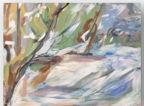
THAT WINTER MOMENT