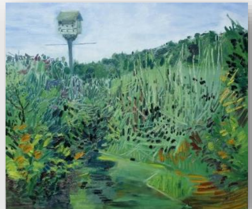
SHELTER, PURPLE MARTIN COLONY BIRDHOUSE