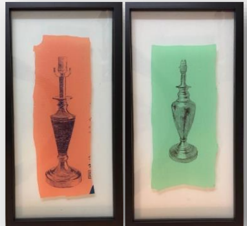
TABLE LAMP ORANGE / GREEN