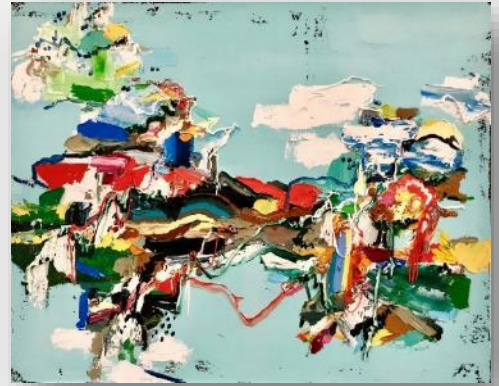
VIVID CUBAN WORDS