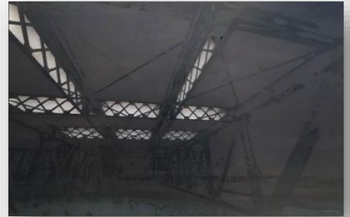
QUEEN STREET BRIDGE