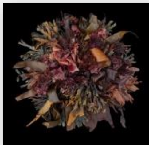
SEAWEED BOUQUET 13