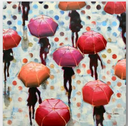
HERE COMES THE RAIN