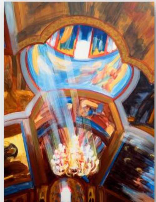
ST. DIMITRIJA II