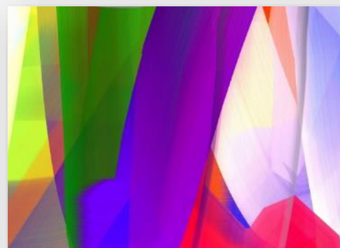
THREE O'CLOCK (EDITION 1/3)