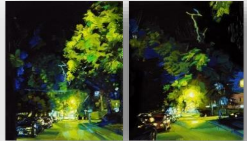
NO PLACE 420