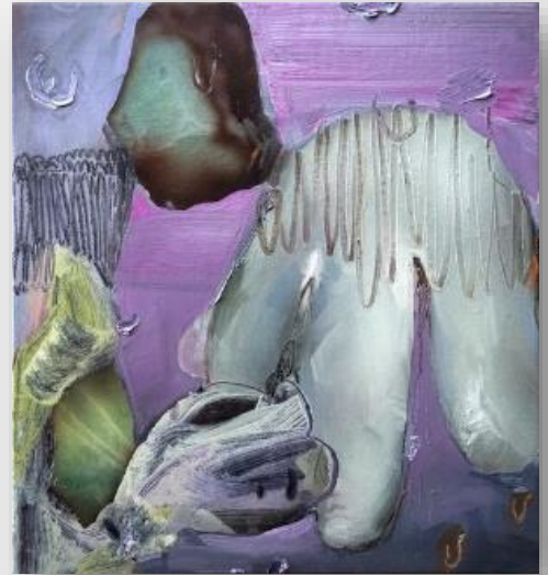
HAVING MANY ARMS WITHOUT A GRIP